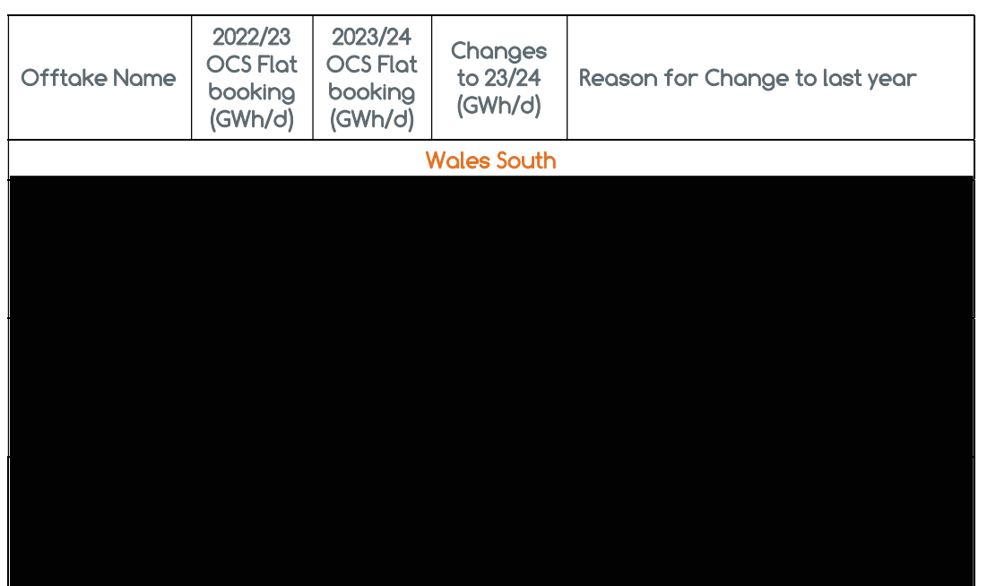
Table 1: This year versus last year - Flat Capacity

We would have reduced our flat bookings further and in line with our forecasts but have been unable to due to existing User Commitment (UC) in most cases.