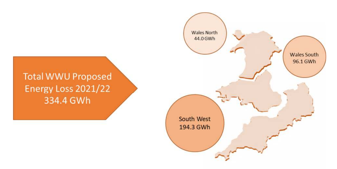
Figure 1: Breakdown of Energy Loss by LDZ

Fugitive emissions of gas (leakage and venting) have been estimated using forecast asset population as at 31<sup>st</sup> March 2021. WWU has considered Own Use Gas (OUG) and Theft of Gas (ToG) and propose using the same factor as previous years. The Energy Loss for 2021-22 is estimated at 0.55% of total demand through the WWU system.